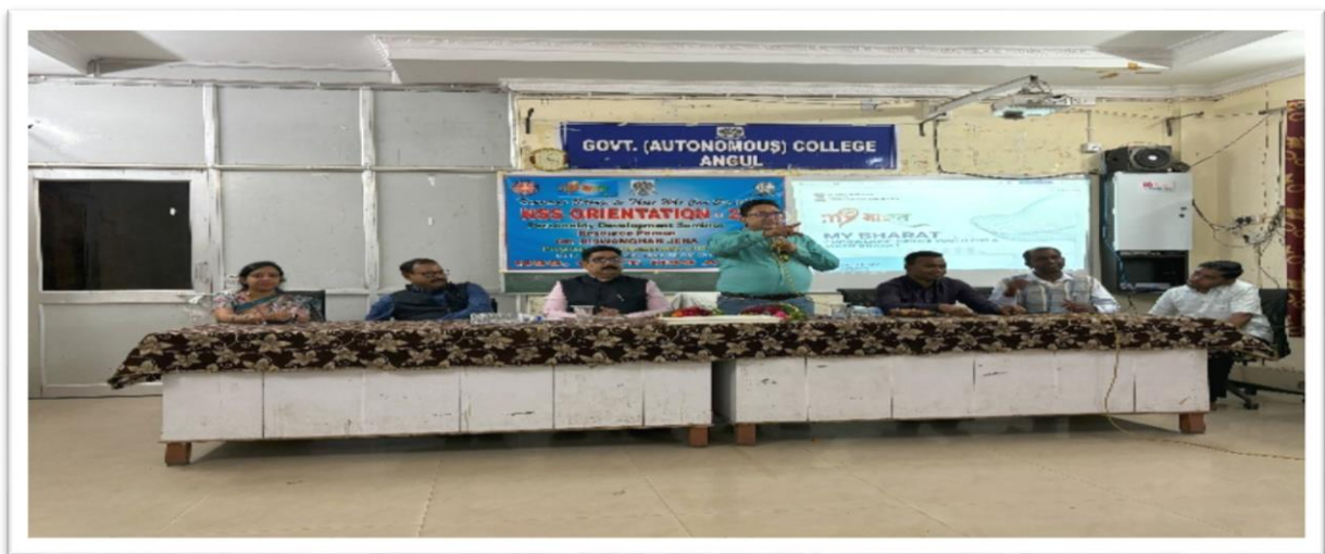
Room No- 001