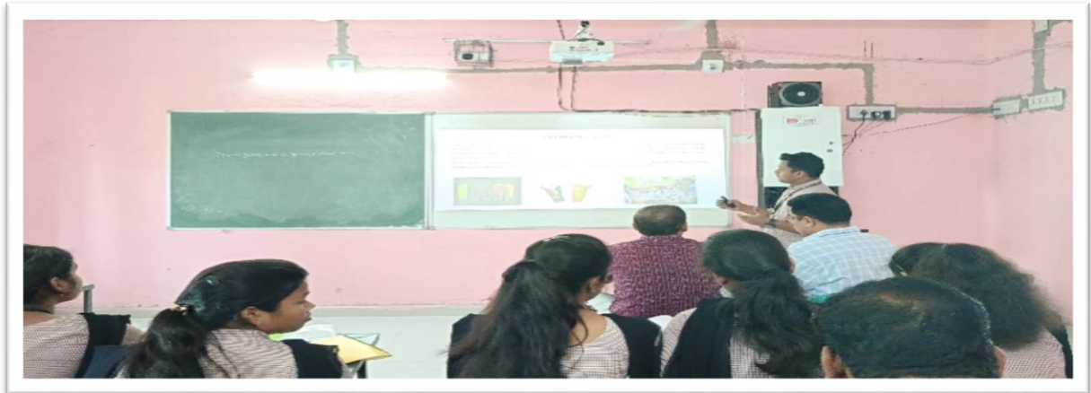
Room No- 128