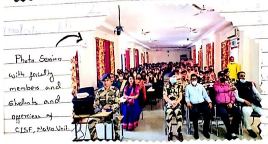
Photo Series with faculty members and students and officers of CISF, Malavali.