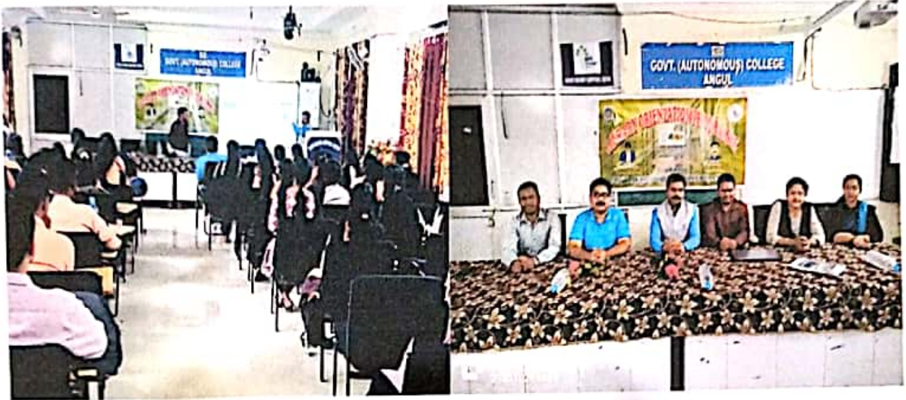
Library Orientation Programme