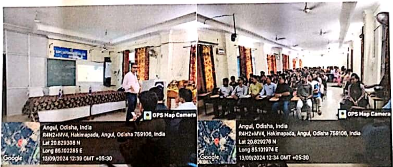
Training programme by EBSCO