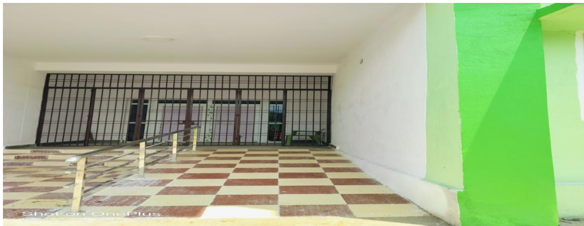
Facilities of RAMPs for easy access to classrooms