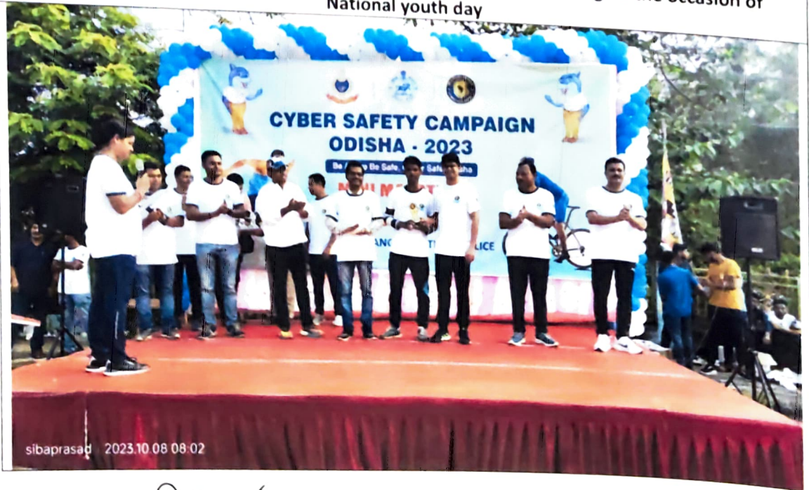
Awareness about community service, cleanliness health and saving on the occasion of National youth day

[Signature] 20.01.25 Principal Govt. Auto. College, Angul