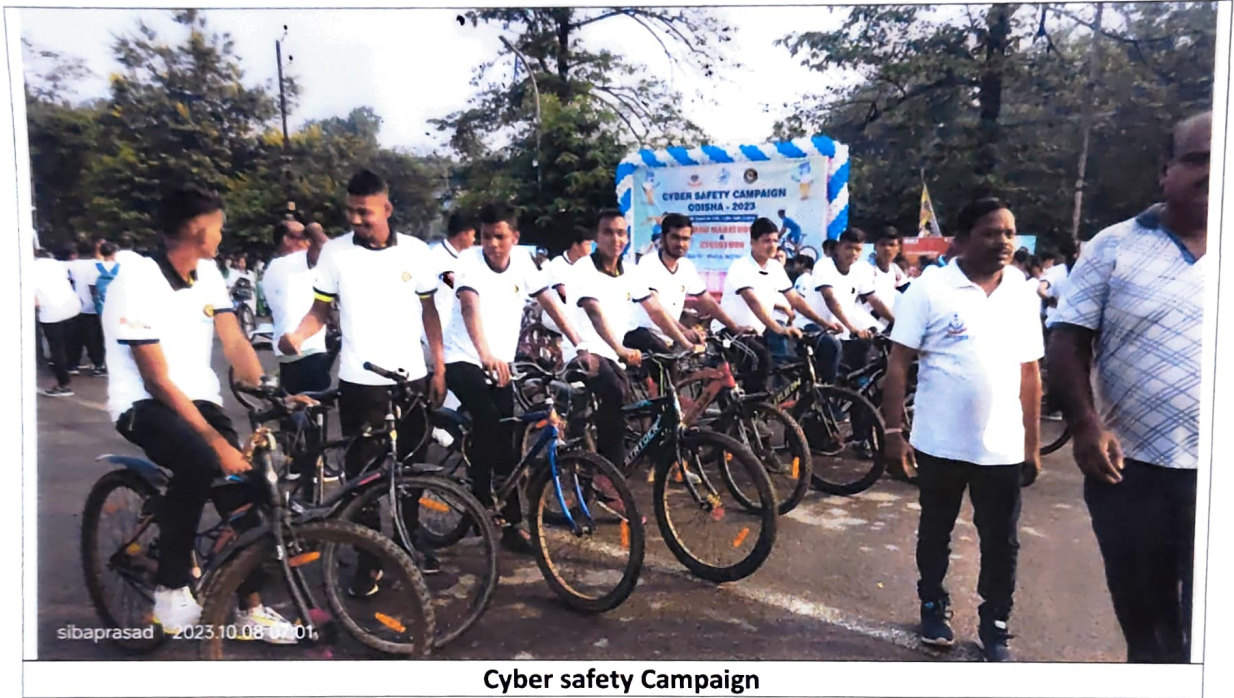
Cyber safety Campaign