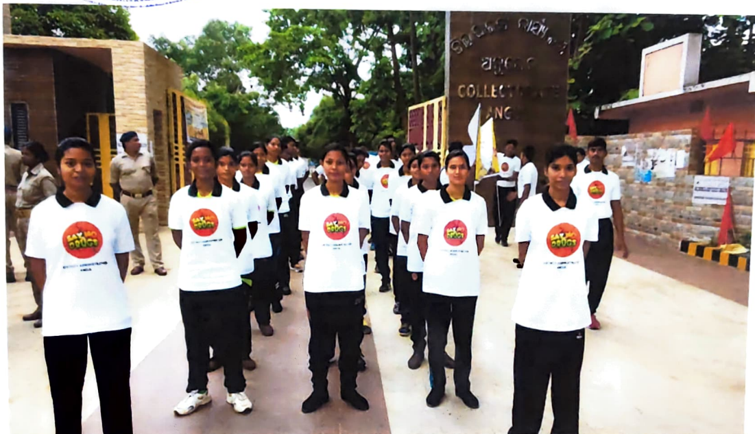
"SAY NO TO DRUGS" CAMPAIGN