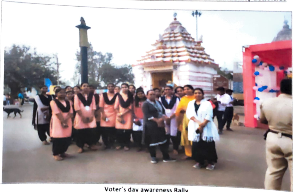
Voter's day awareness Rally

[Signature] 20.01.25 Principal Govt. Auto. College, Angul